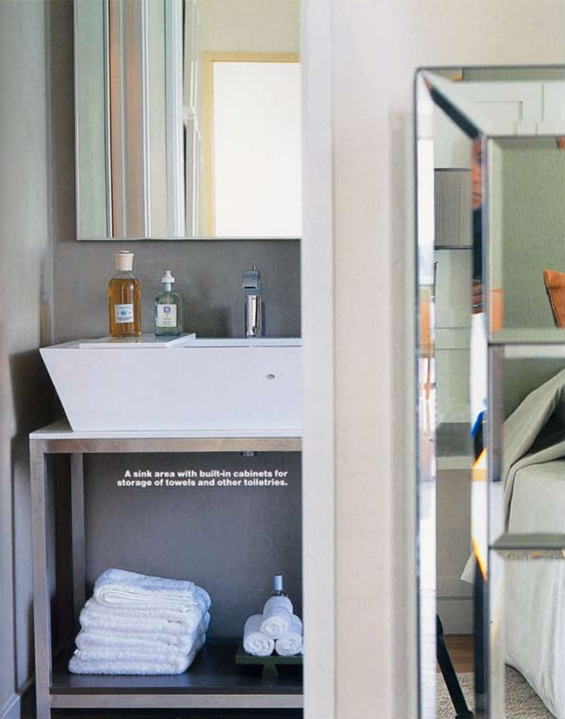
A sink area with built-in cabinets for storage of towels and other toiletries.

Side tables with mirrors to reflect, lamps with transparent glass bases, photoframes, silverware from Lambert, the wall-to-wall bookcase in the study which floats and has a glass backdrop so one can see through to the view, as does the study table, a huge mirror in the living area and the mirrored chest of drawers in the master bedroom, were all carefully selected and strategically placed by the designer to enhance the visual space and the view. Rather than crowding the areas with too much furniture, everything is kept