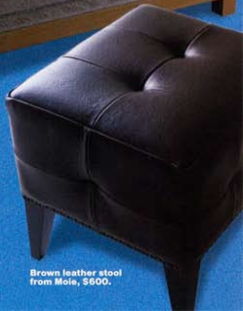
Brown leather stool from Mole, $600.