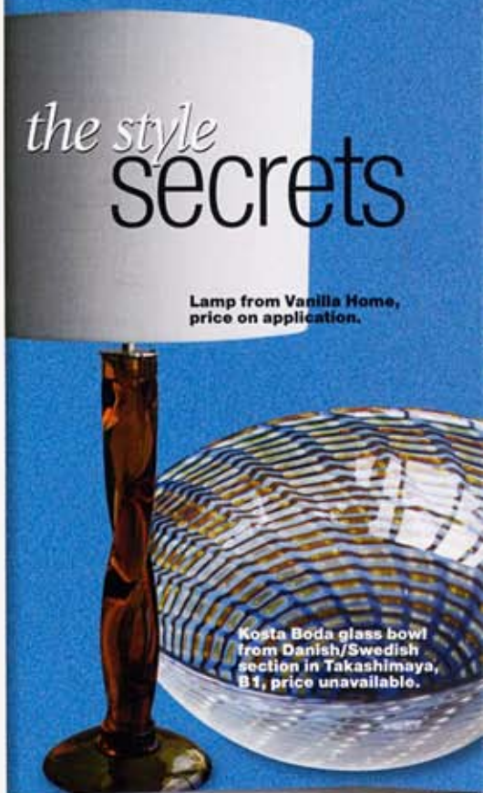
Kosta Boda glass bowl from Danish/Swedish section in Takashimaya, B1, price unavailable.