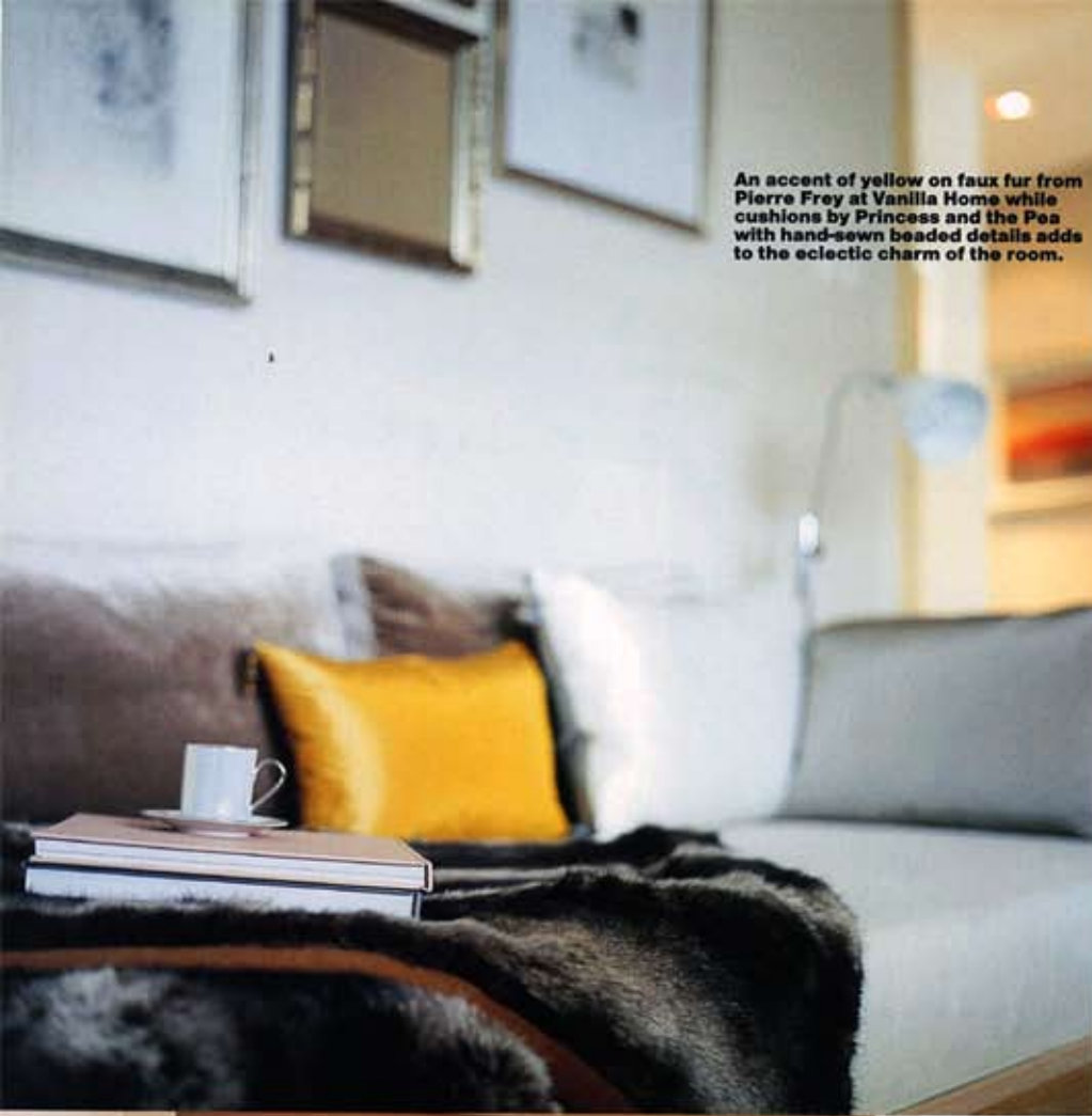
An accent of yellow on faux fur from Pierre Frey at Vanilla Home while cushions by Princess and the Pea with hand-sewn beaded details adds to the eclectic charm of the room.