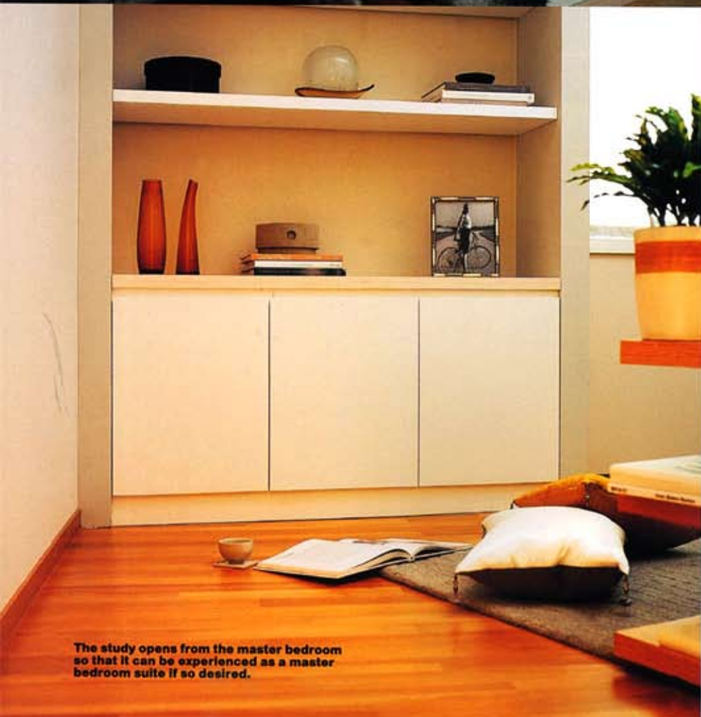
The study opens from the master bedroom so that it can be experienced as a master bedroom suite if so desired.

Blessed with floor-to-ceiling windows to maximise the view of the river, the flat gets plenty of light, a consideration when it came to decorating. "We had to not over-decorate on purpose so that we wouldn't take the focus away from the glass windows and water views." Sheer Italian linen blinds were chosen over drapes so as not to clutter and provide a seamless and unspoilt view of the river. A large see-through Bespoke by JMI glass table gives a sense of largess to the space. Each room has a strong colour identity which adheres to the subtle grandeur of luxury. Says Janet on the colour scheme, "Generally we worked with a neutral palette using varying tones of taupe, lattes and mochas. We then isolated colours for different rooms as a focus." The living room is amber with a light Danish blue inspired by the tableware from Royal Copenhagen. The study is literally a "study" in yellow ochres and pale blues as seen in the artwork by Australian Neil Thwaite. In the master bedroom, orange is mixed with amethyst for a richer palette. The reading room is yellow ochre and the guest room is icy blue to simulate water.